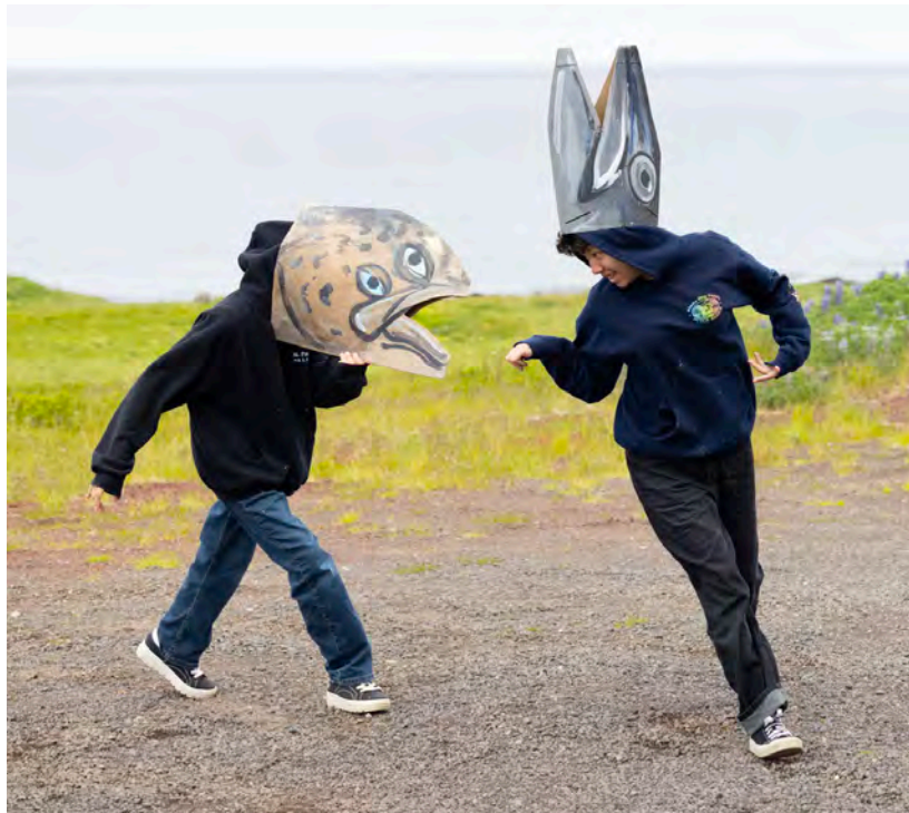
Students from St. George and St. Paul Islands playing Fish Food Chain Tag game, one of many school grant funded educational activities.

For more information contact: APICDA Programs Email: education@apicda.com