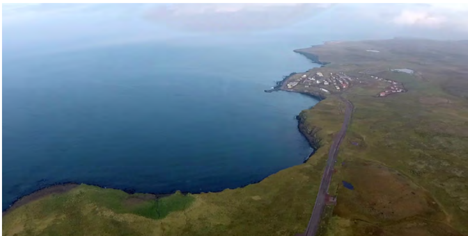
Pictured above: St. George Harbor area.

APICDA Programs Email: programs@apicda.com Phone: 1-888-927-4232