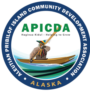
PHOTO CONTEST DETAILS