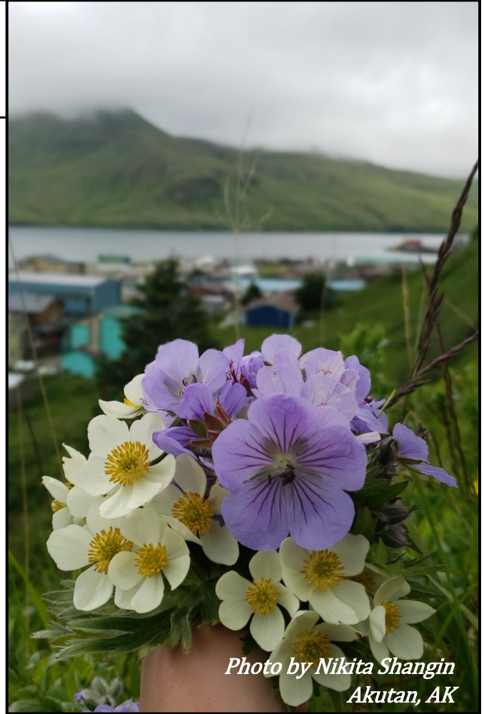
Akutan, AK

Contact your Community Liaison Officer (CLO) for more info about APICDA's training and education programs! Give your CLO a call today to start the discussion.