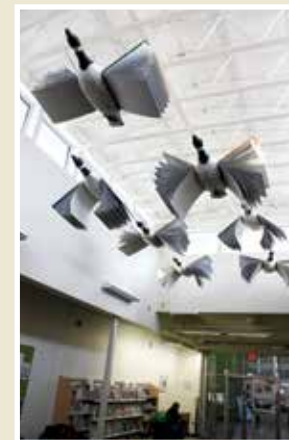
"Transported" Canadian Geese with books for wings. Lifesized. 2012. Mt. View Library, Anchorage. Aluminum, foam and acrylic.