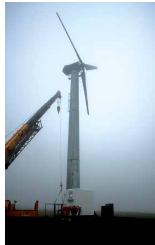
Windmatic turbine installation on St. George Island.

The new system will be operated and maintained by the city-owned utility and is projected to provide more than half of the community's electricity needs and significantly reduce the current $1/Kwh residential rate. Both the diesel and renewable generation components will have added benefits of utilizing waste heat from power production, further reducing heating related costs for community buildings.