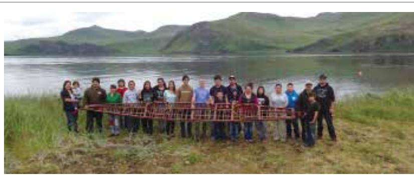
Group from Akutan Qugiigun Culture Camp August 2014.