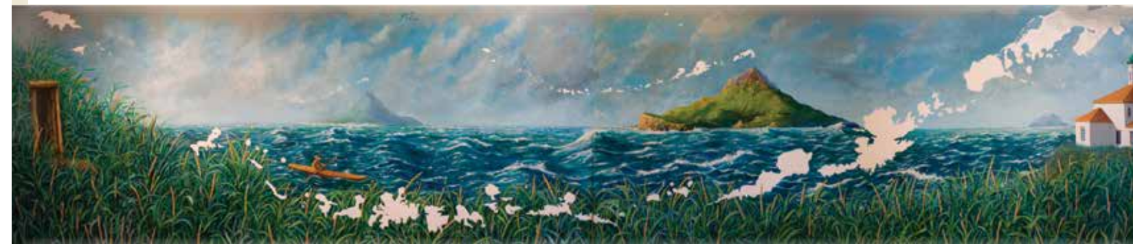
This painting was commissioned for the hallway at the APICDA corporate office in Juneau. It is 4'x20' acrylic on aluminum panels. All the volcanoes are belching smoke in the image of the Aleutian Chain.