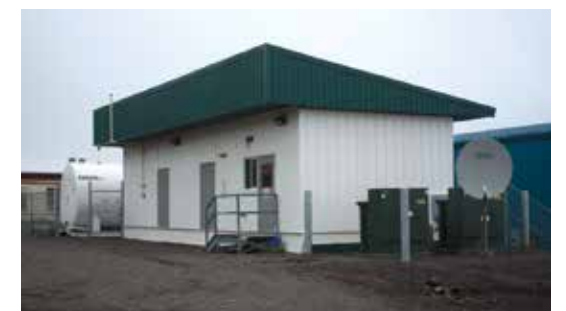
New genset house.

Alaska has quickly become a global leader in remote wind diesel systems. We commend the community leaders of St. George, the Alaska Energy Authority and contractors on work well done. APICDA looks forward to a continued partnership on future renewable energy projects throughout our region. ▲