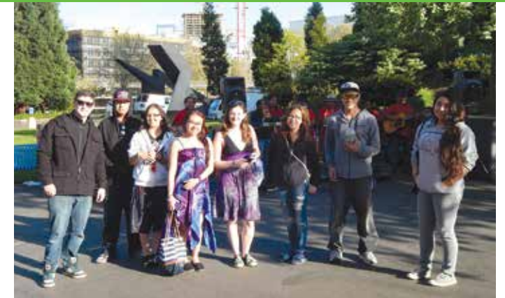
Students from Nelson Lagoon and Akutan in Seattle.

They followed these tours with sightseeing trips to the Space Needle, Pike Place Market, the Seattle Aquarium, the Pacific Science Center, Woodland Park Zoo, the Museum of Flight,